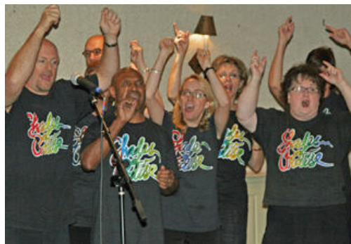
The Shades of Praise, a New Orleans interracial gospel choir, inspired the audience of 82 low- income advocates with a lunch time performance.