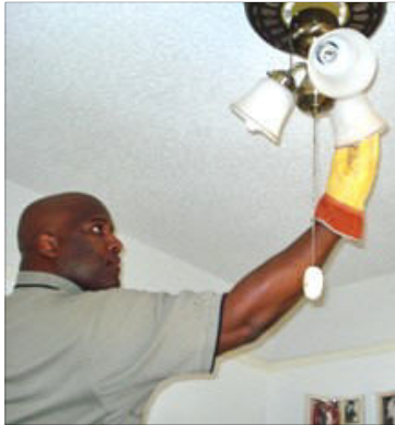
ENO President and CEO Rod West installs a compact fluorescent light bulb in the home of a Holy Cross neighborhood resident.

New Orleans residents learned this month how easy it is to change the world by making a simple switch to energy-efficient light bulbs, when Entergy employees stepped in to make the switch for them.